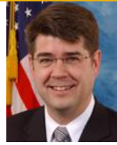
Lee Terry (Republican)